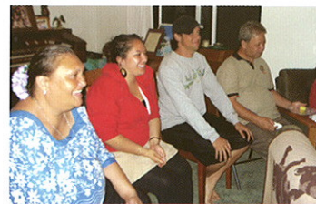
Guests enjoy the presentation and discussion at a Coffee Hour in Kula, Maui.

A: Different Hawaiian institutions keep registries for their specific needs, which vary according to the programs and services these institutions provide. Registries are kept confidential in order to protect the privacy of Hawaiians who are registered. Kau Inoa cooperates with DHHL, Kamehameha Schools, and OHA to make it easier for Hawaiians to verify their ancestry. By marking